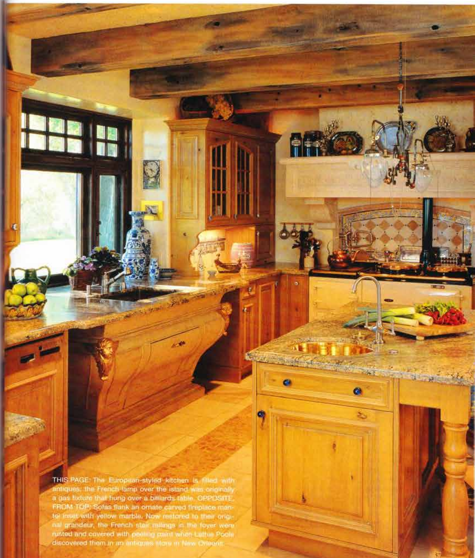
THIS PAGE: The European-styled kitchen is filled with antiques; the French lamp over the island was originally a gas fixture that hung over a billiards table. OPPOSITE, FROM TOP: Sofas flank an ornate carved fireplace mantel inset with yellow marble. Now restored to their original grandeur, the French stair railings in the foyer were rusted and covered with peeling paint when Lathus Poole discovered them in an antiques store in New Orleans.